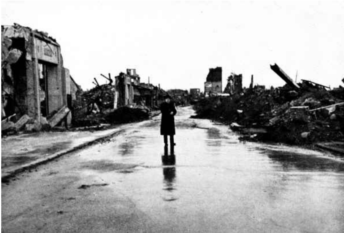
High Street, Düren, June 1946. Shown is Victor Gollancz